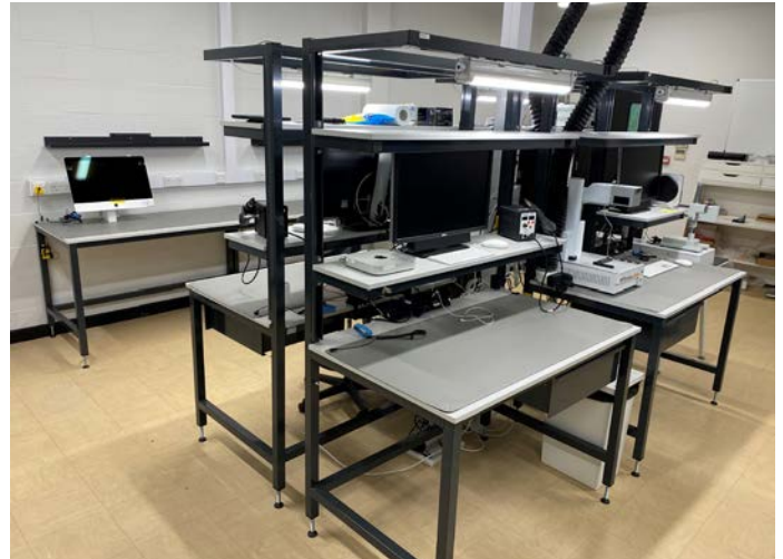
Electrical workbenches for Apple device repair