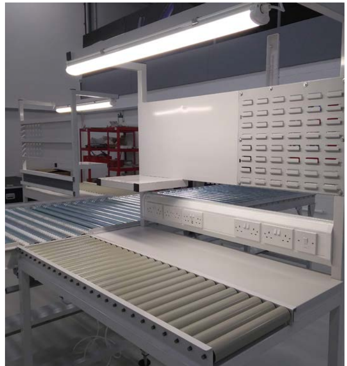
Assembly line with workbenches for battery assembly and testing