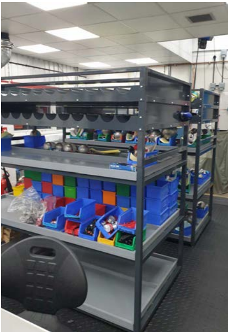
Bespoke workshop storage rack for small components

We manufacture bespoke shelving and racking to complement your electrical workbenches and workstations, these are ideal for component storage or for use as equipment charging stations.