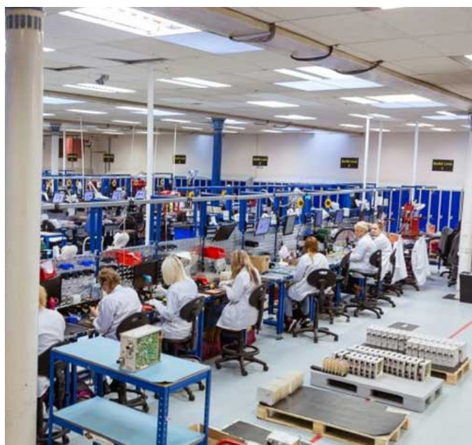
Electronics assembly workstations