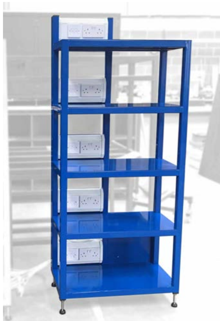
Shelving with sockets for use as a laptop charging station.