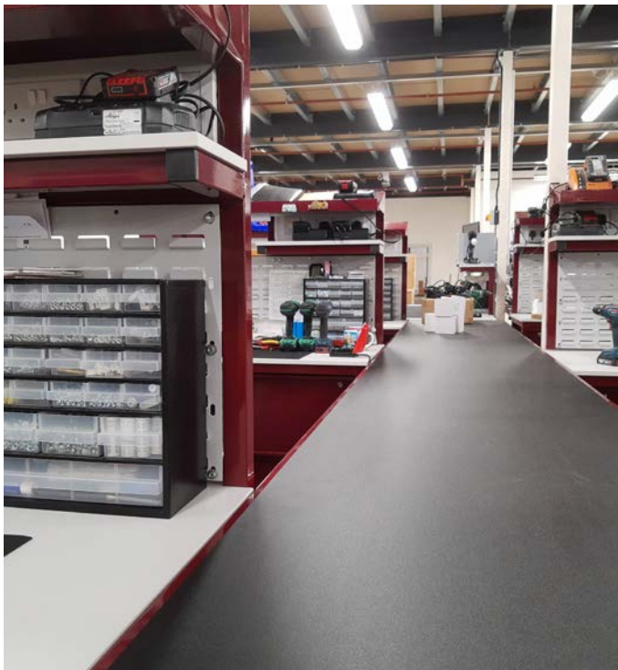
Electrical assembly line with belt conveyor for lighting manufacturer