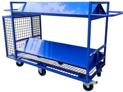
Bespoke warehouse trolley with angled shelving