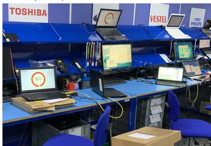
Laptop refurbishment workstations