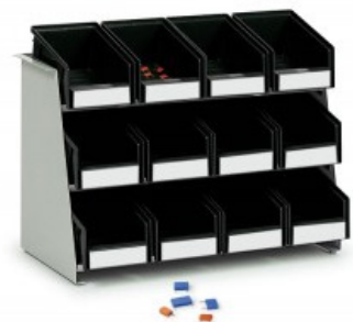
ESD Storage Accessories

Please send us your ESD equipment requirements to receive free quotations