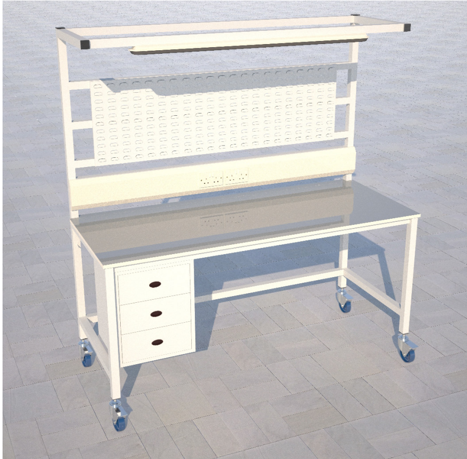
Example render of Electrical Workbench with ESD Castors

As we manufacture to order you can choose from a wide range of options and accessories for your electrical workbench. We deliver each bench fully wired & assembled.