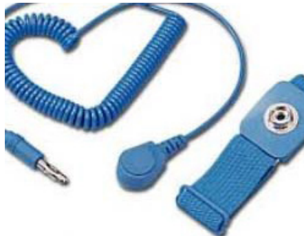
Grounding Cords & Straps