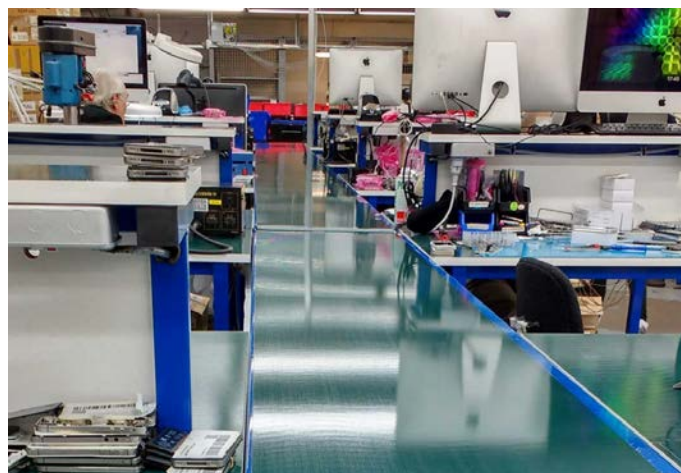
Mobile phone process line

Whatever your process may be, we work with you to understand your needs and offer our bespoke workstation manufacturing expertise to design solutions to improve the speed of processing for all types of consumer electronics.