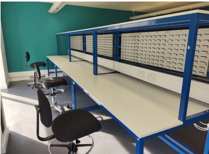
Electronics lab workstations and clean room