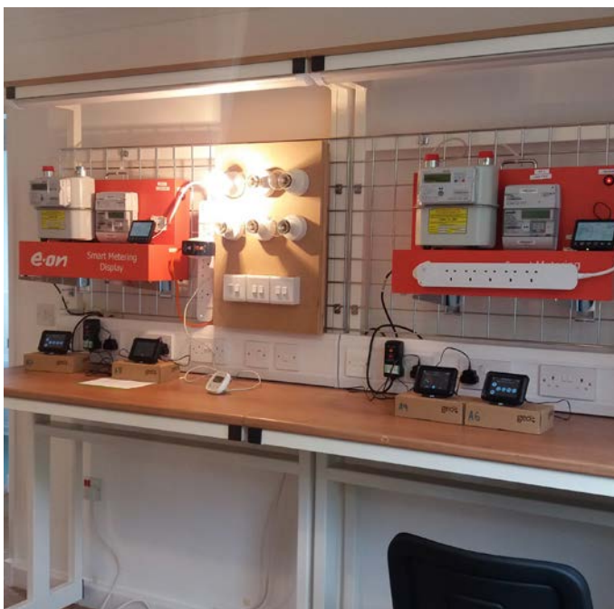
Cantilever Testing Stations for Smart Meters

High volume repair, refurbishment and testing workstations are built to maximise volumes and reduce processing time. We manufacture these fully bespoke to suit your products and processes.