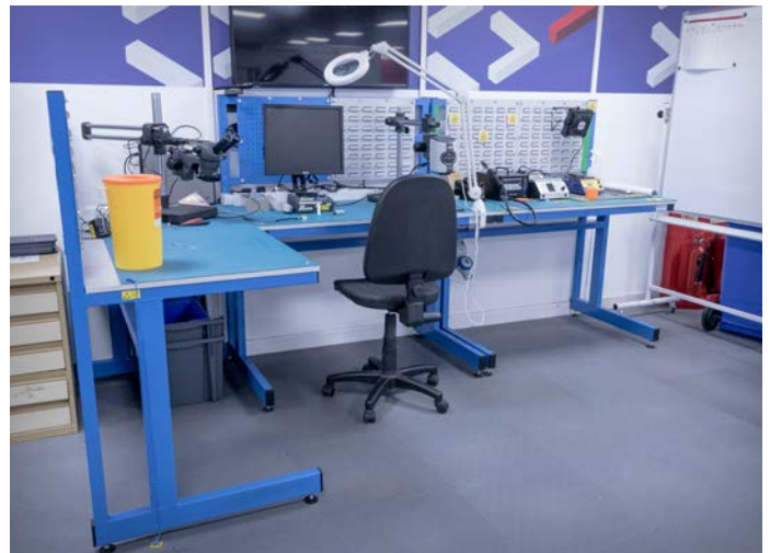
Cantilever electrical workbench cell with partitions