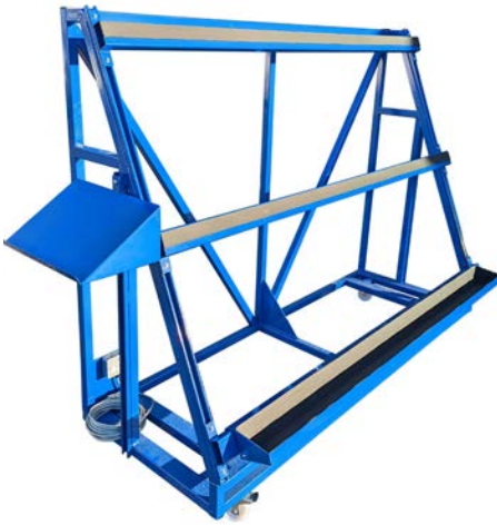
Bespoke a-frame trolley for flat panel transportation & testing

Trolleys are essential in some electronics processing and assembly environments for transporting large or bulky materials or products. Each trolley can be made bespoke to suit your requirements.