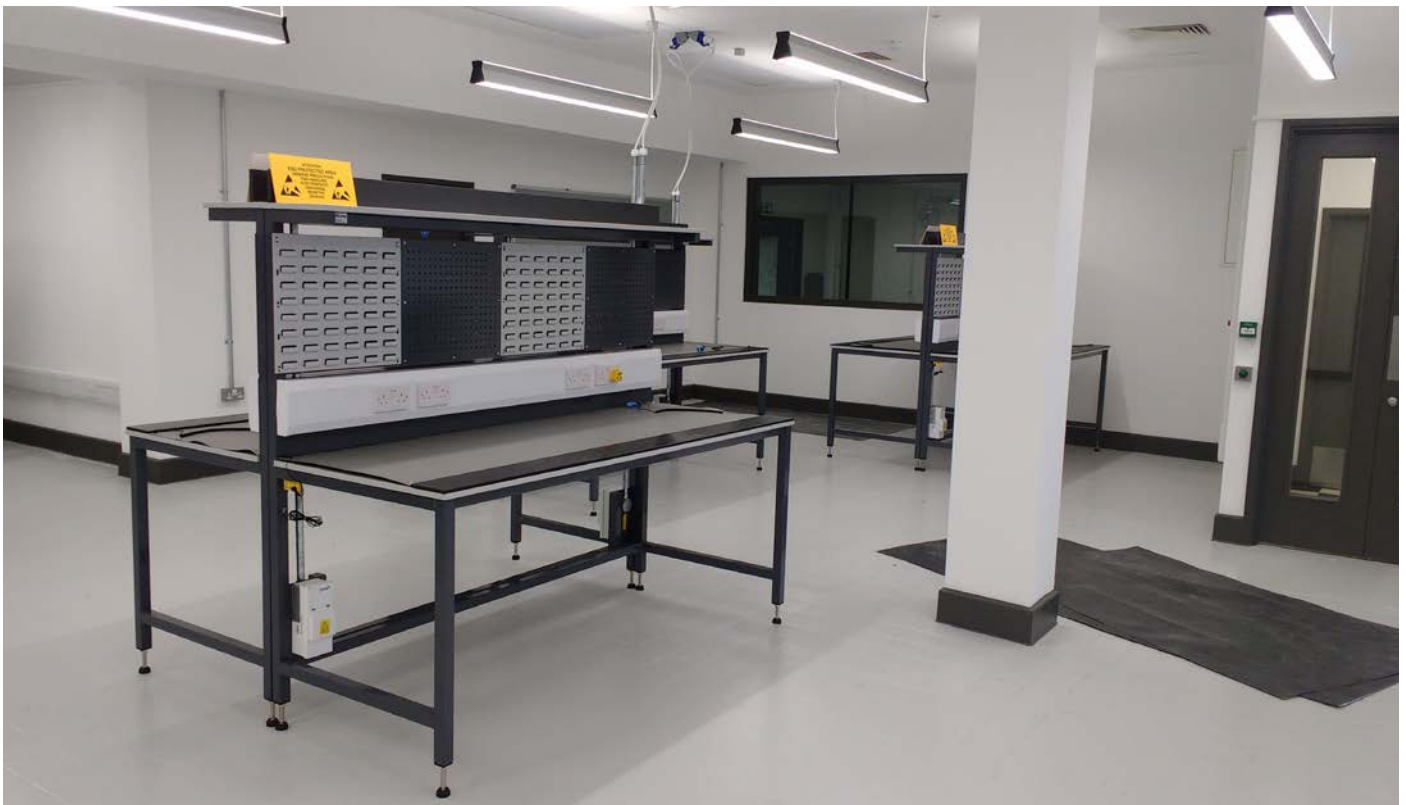
ESD Workbenches for College Workshop Space