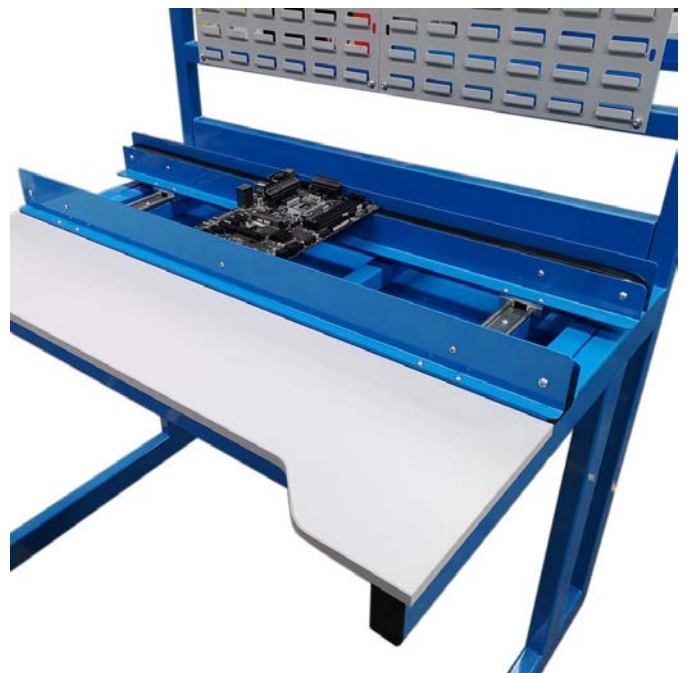
Bespoke Workbench for PCB Assembly