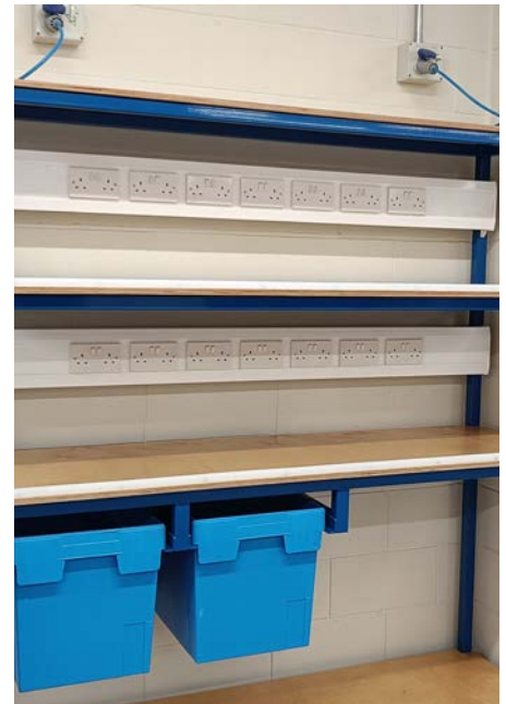
Battery charging station shelving unit with storage totes