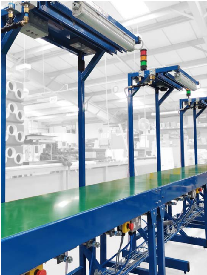
Lean process assembly line for ventilation product manufacturer

Please contact our helpful sales team or speak to our engineers about your requirements to receive a free quotation.