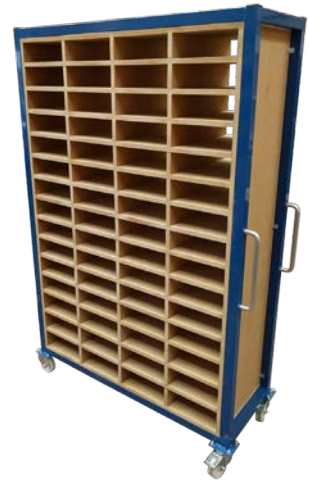
Pigeonhole trolley for small component sorting