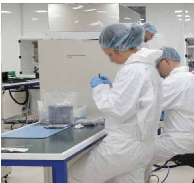
HEPA Filter Clean room workbenches for mobile phone repair