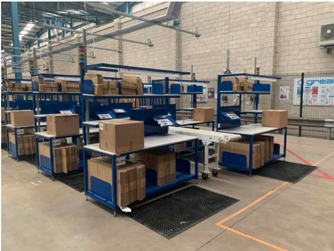
Packing stations for distribution centre

To see further examples of packing stations and project case studies please visit our website or contact our helpful sales team with some details about your requirements.