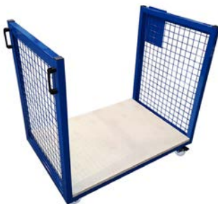
2-Sided Cage Trolley