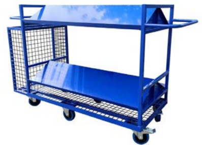
Bespoke Warehouse Trolley