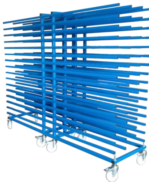
Drying Rack Trolley