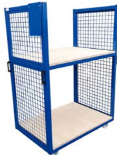
2-Sided Cage Trolley with Shelf