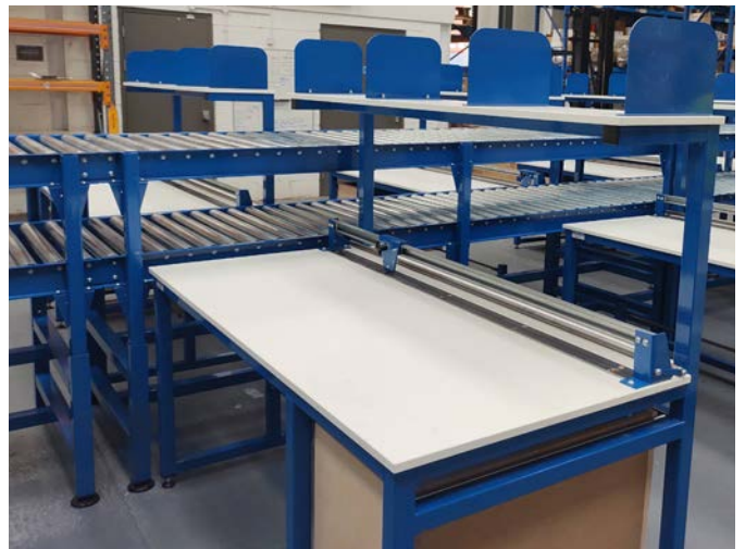
Packing station with packaging cutter & pull-out bin