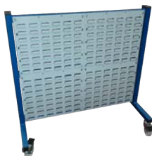
Louvre Panel Trolley