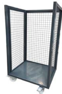
3-Sided Cage Trolley