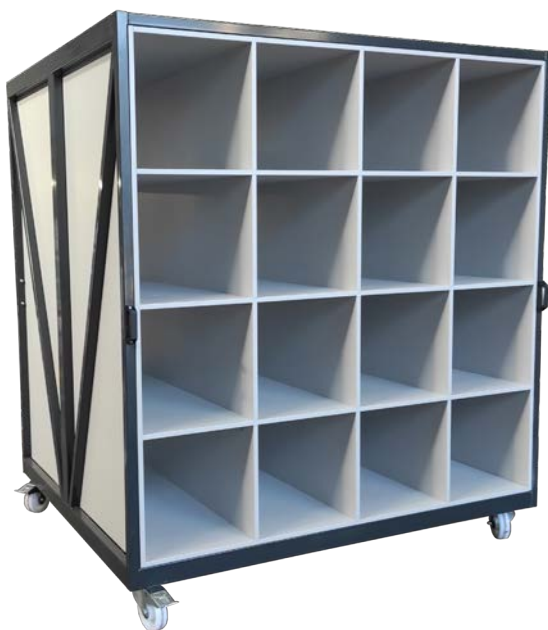
Pigeonhole Storage Trolley

Similarly we can also create factory or warehouse layout drawings for larger projects.