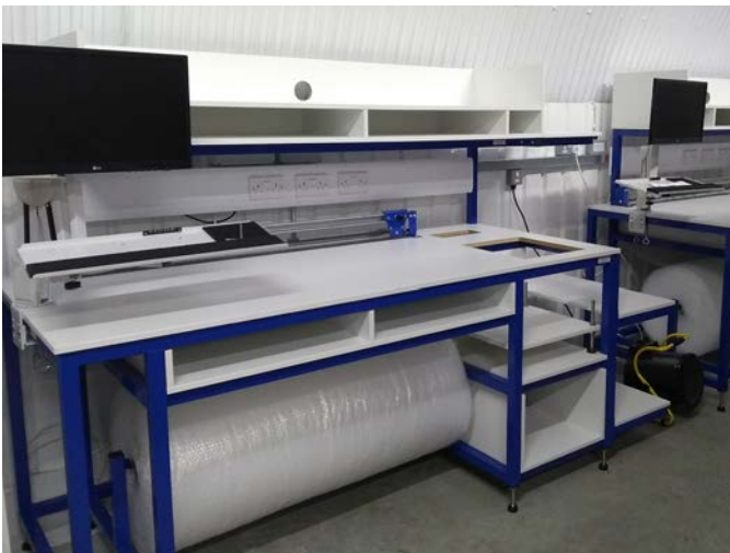
Packing bench with bubble wrap roll holder