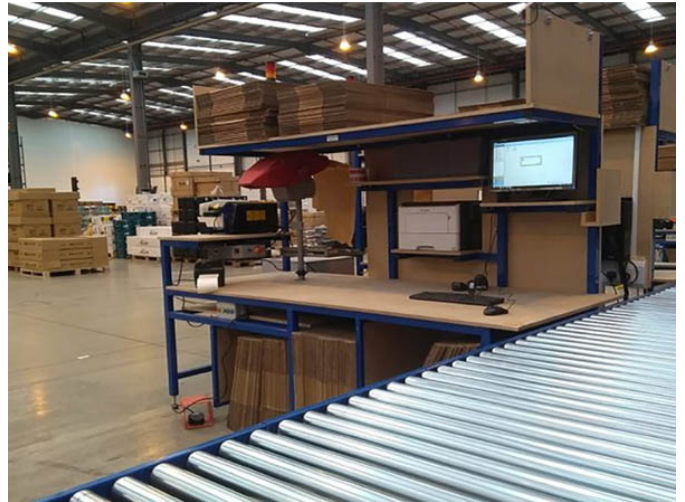
Warehouse packing station with box storage