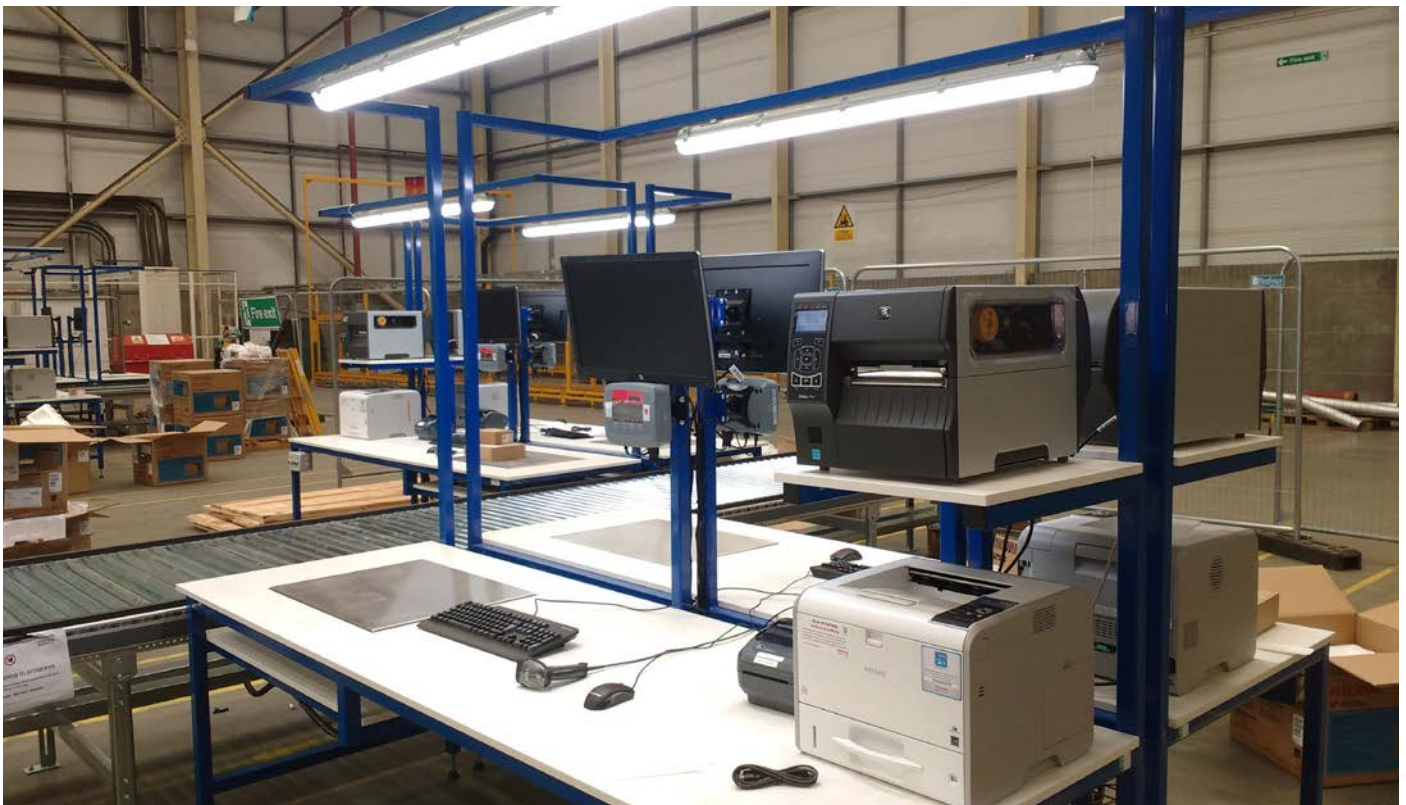
Packing station with built-in scales, printer shelves, and a lighting rail to improve visibility